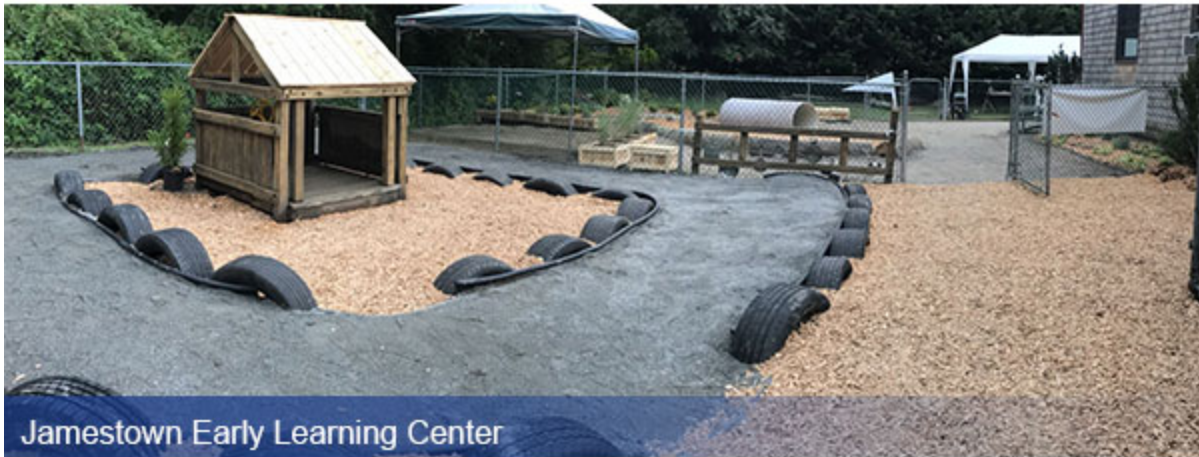
Jamestown Early Learning Center