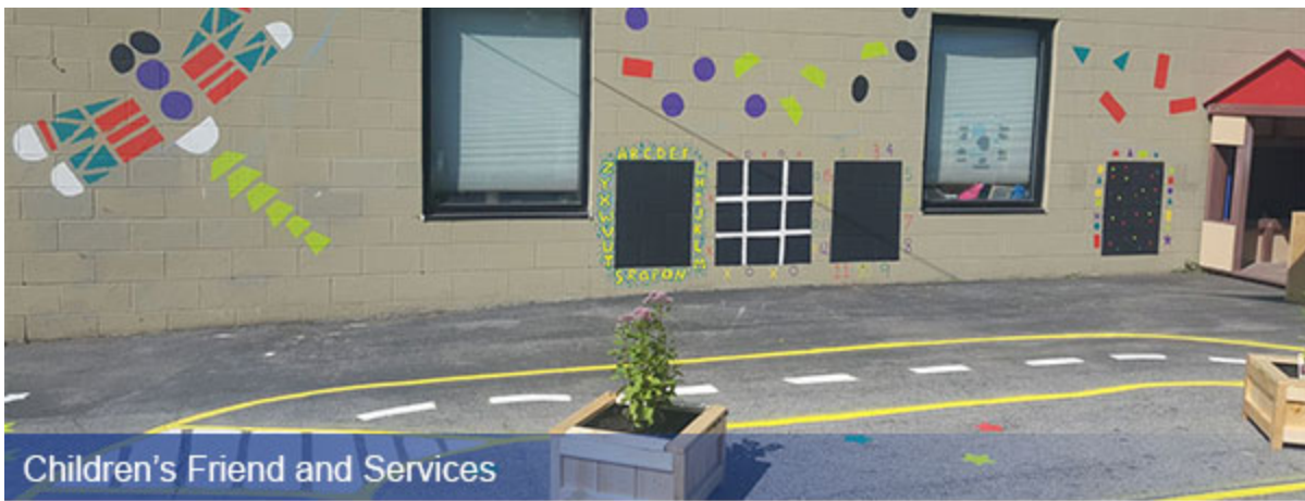
Children's Friend and Services