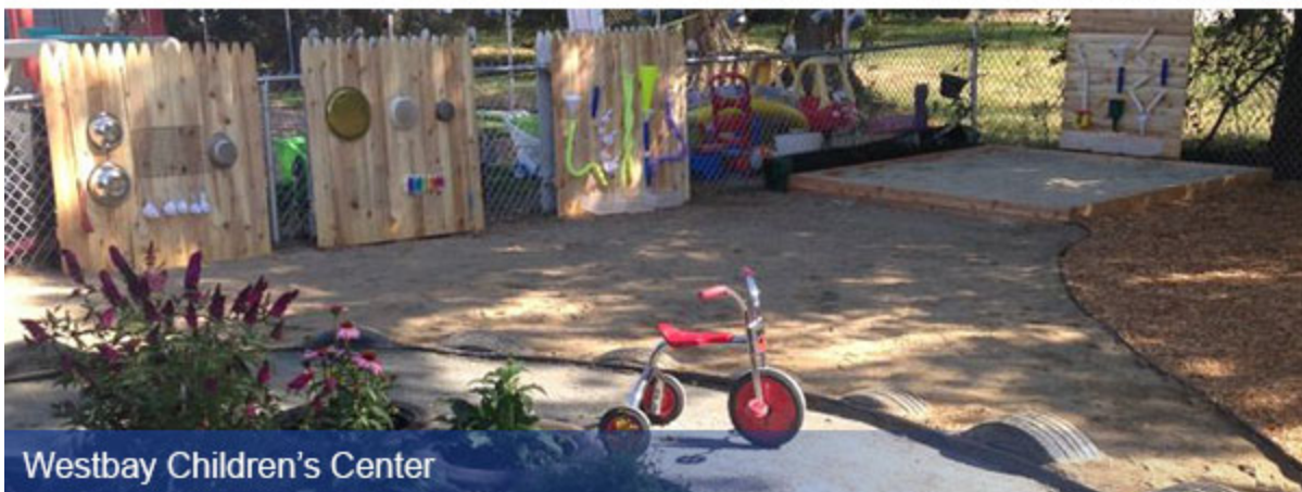
Westbay Children's Center

Visit www.bcbsri.com or search #BlueAcrossRI on social media to learn more about this amazing event.