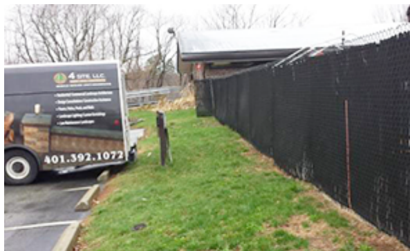
Play space fencing with no vehicular barriers