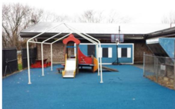
Composite play structure likely over 20 years old has an inadequate use zone, with shade awning too close. Also heavy mechanical unit fencing, though kept locked, due to 4' height is potentially accessible to children.

The Cornerstone School was built in 1972 and has been a resource for families for over 40 years providing a variety of services including an integrated early childhood program. After years of wear and tear, Cornerstone School was faced with an outdoor play space that had many challenges. Most significant were a worn and heaving playground surface, an aging play structure and the need for better playground fencing, all to improve safety and the children's enjoyment of the playground. The school's focus on serving children with a range of special needs and abilities created particular issues with the space, which lacked accessibility in a number of ways. Cornerstone was committed to re-modeling the playground, but lacked the funding to do so. In addition, they just weren't sure where to begin! Cornerstone received an Early Learning Facility Planning Grant that allowed them to conduct a full safety audit on the space and to create a prioritized plan to redevelop the space into something that better met their needs.