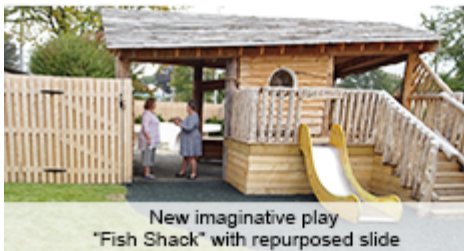
New imaginative play "Fish Shack" with repurposed slide