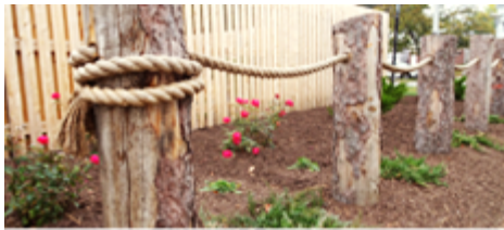
New fencing with new vehicular barriers