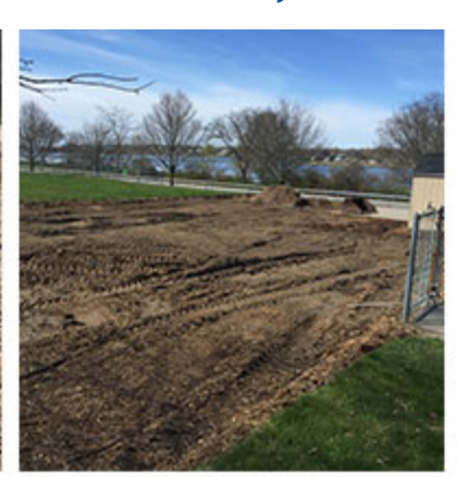
Newport County YMCA