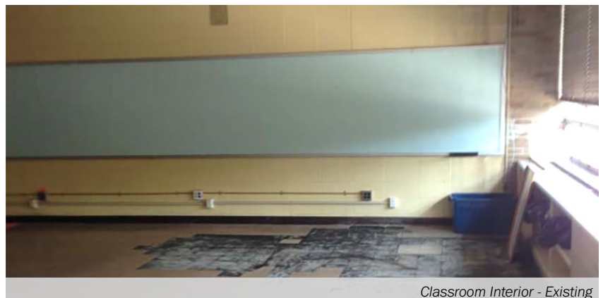
Classroom Interior - Existing