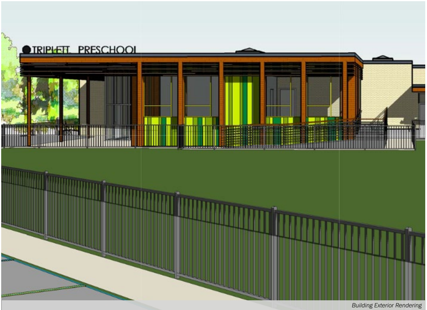
Building Exterior Rendering

In 2014, the East Bay Community Action Program, in collaboration with Newport Public Schools, conducted a feasibility study to evaluate the potential for repurposing the closed George H. Triplett School located on 435 Broadway in Newport, RI, into a preschool center offering pre-k and Head Start programming. This was spurred by the lack of available and appropriate space for early childhood programming which was inhibiting program growth.