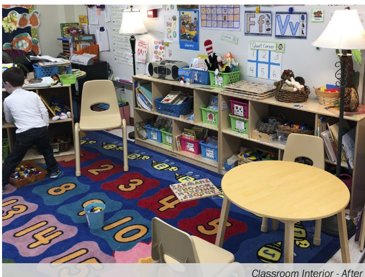
Classroom Interior - After