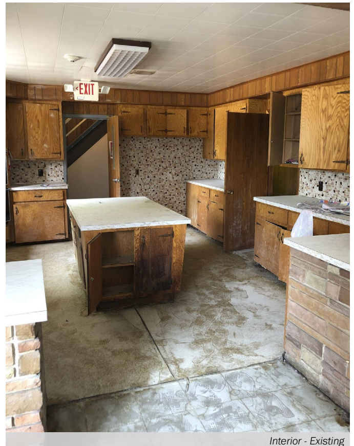
Interior - Existing