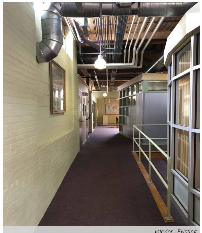
Interior - Existing