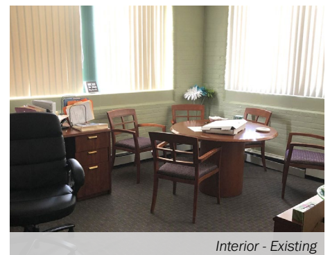
Interior - Existing