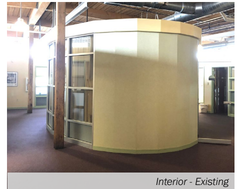
Interior - Existing