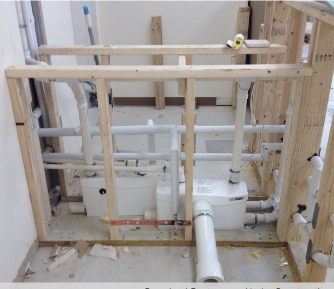
Preschool Restrooms - Under Construction